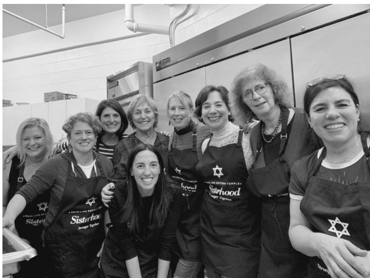
Sisters who came together to make and serve Shabbat dinner to around 100 WINSTY attendees!