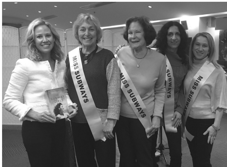
Sisterhood welcomed Susie Orman Schnall, author of The Subway Girls , during the annual Book Review & Brunch